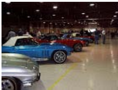
Joplin NCRS Regional - 2011 Apr 28, 2011

You are invited to view the Joplin Regional NCRS photo album: Joplin NCRS Regional - 2011