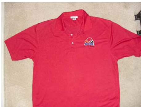
Style #3 - (100% Polyester - Moisture free knit golf) $30.00