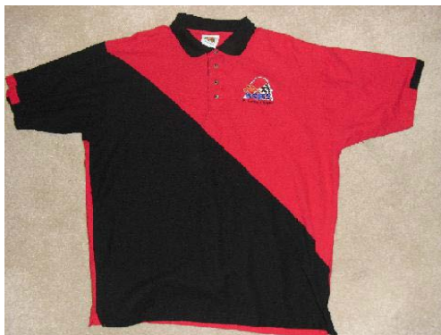
Style #2 - (100% Cotton Pique Knit) $35.00 - Men's - S through XXXL